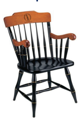
Black with Cherry Arms and Seal